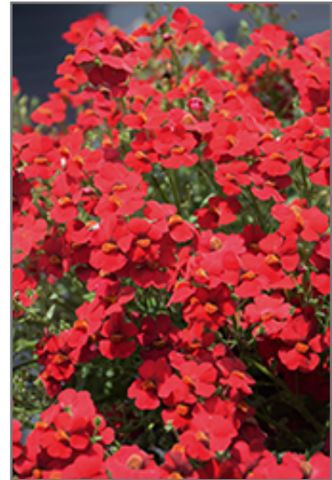
Sunsatia Cranberry Red Nemesia flowers