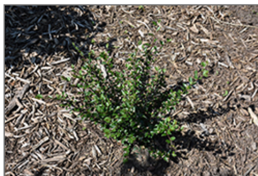
Autumn Inferno Cotoneaster