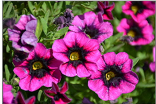
Superbells Blackcurrent Punch Calibrachoa flowers

Superbells Blackcurrent Punch Calibrachoa will grow to be about 10 inches tall at maturity, with a spread of 24 inches. When grown in masses or used as a bedding plant, individual plants should be spaced approximately 12 inches apart. Its foliage tends to remain low and dense right to the ground. This fast-growing annual will normally live for one full growing season, needing replacement the following year.