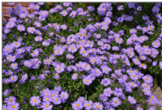
Romany Aster flowers

Romany Aster is recommended for the following landscape applications;