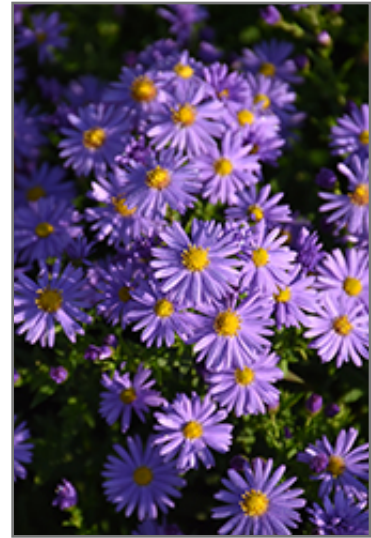
Romany Aster flowers

This plant is not reliably hardy in our region, and certain restrictions may apply; contact the store for more information.