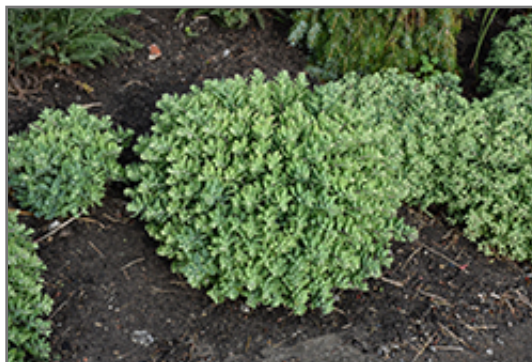
Powderpuff Stonecrop

Powderpuff Stonecrop will grow to be about 8 inches tall at maturity, with a spread of 18 inches. When grown in masses or used as a bedding plant, individual plants should be spaced approximately 16 inches apart. Its foliage tends to remain low and dense right to the ground. It grows at a fast rate, and under ideal conditions can be expected to live for approximately 15 years. As an herbaceous perennial, this plant will usually die back to the crown each winter, and will regrow from the base each spring. Be careful not to disturb the crown in late winter when it may not be readily seen!