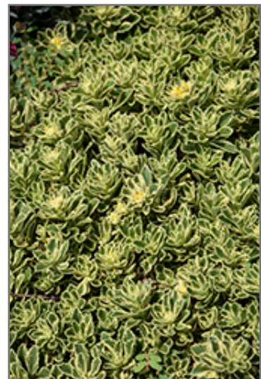
Rock 'N Low Boogie Woogie Stonecrop