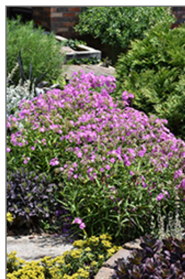
Opening Act Ultrapink Phlox in bloom