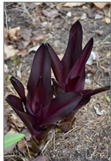
African Night Pineapple Lily