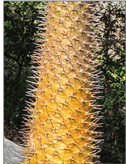
Madagascar Palm bark

This plant is not reliably hardy in our region, and certain restrictions may apply; contact the store for more information.