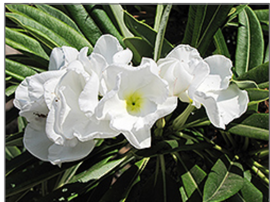
Madagascar Palm flowers