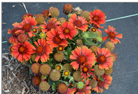
SpinTop Yellow Touch Blanket Flower in bloom

This plant is not reliably hardy in our region, and certain restrictions may apply; contact the store for more information.