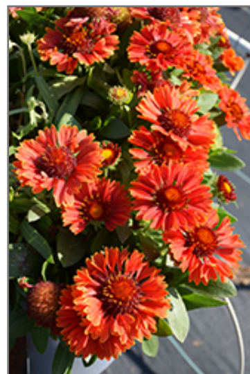
SpinTop Yellow Touch Blanket Flower flowers

This plant will require occasional maintenance and upkeep. Trim off the flower heads after they fade and die to encourage more blooms late into the season. It is a good choice for attracting bees and butterflies to your yard, but is not particularly attractive to deer who tend to leave it alone in favor of tastier treats. It has no significant negative characteristics.