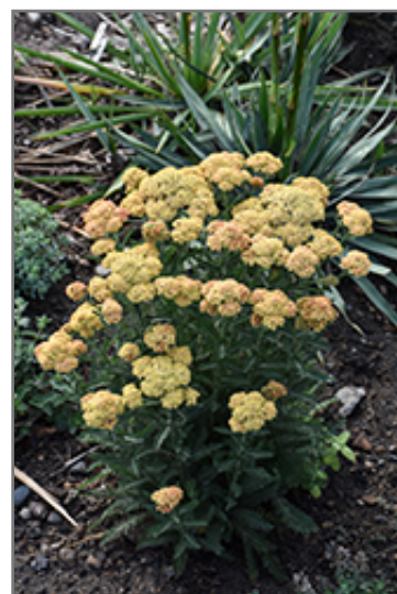
Firefly Peach Sky Yarrow in bloom