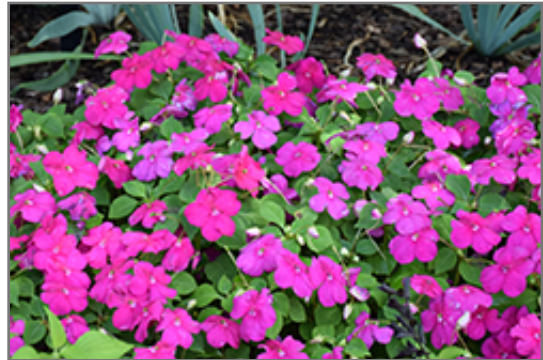
Beacon Violet Shades Impatiens flowers

Beacon Violet Shades Impatiens will grow to be about 15 inches tall at maturity, with a spread of 12 inches. When grown in masses or used as a bedding plant, individual plants should be spaced approximately 8 inches apart. Its foliage tends to remain dense right to the ground, not requiring facer plants in front. This fast-growing annual will normally live for one full growing season, needing replacement the following year.