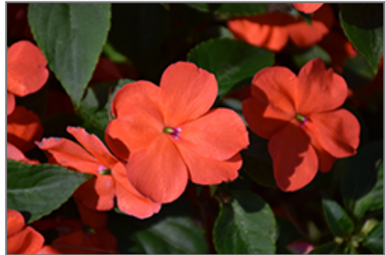
Beacon Salmon Impatiens flowers

Beacon Salmon Impatiens will grow to be about 15 inches tall at maturity, with a spread of 12 inches. When grown in masses or used as a bedding plant, individual plants should be spaced approximately 8 inches apart. Its foliage tends to remain dense right to the ground, not requiring facer plants in front. This fast-growing annual will normally live for one full growing season, needing replacement the following year.