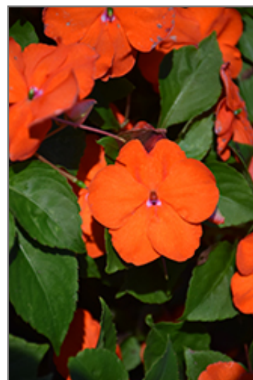
Beacon Orange Impatiens flowers

Beacon Orange Impatiens is recommended for the following landscape applications;