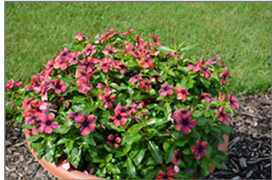
Tattoo Papaya Vinca in bloom

Tattoo Papaya Vinca is a fine choice for the garden, but it is also a good selection for planting in outdoor containers and hanging baskets. It is often used as a 'filler' in the 'spiller-thriller-filler' container combination, providing a mass of flowers against which the thriller plants stand out. Note that when growing plants in outdoor containers and baskets, they may require more frequent waterings than they would in the yard or garden.