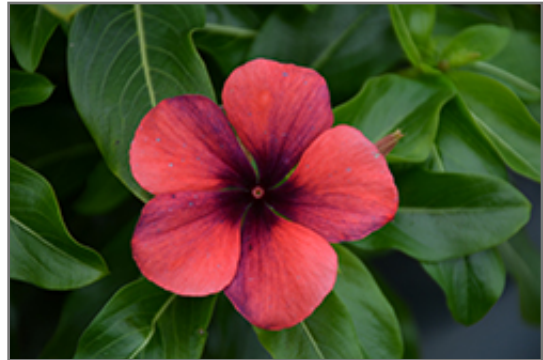
Tattoo Papaya Vinca flowers

This plant will require occasional maintenance and upkeep, and should not require much pruning, except when necessary, such as to remove dieback. It is a good choice for attracting butterflies to your yard, but is not particularly attractive to deer who tend to leave it alone in favor of tastier treats. It has no significant negative characteristics.