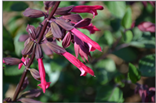
Skyscraper Dark Purple Salvia flowers