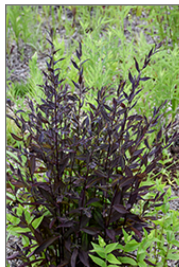
Lady In Black Calico Aster foliage