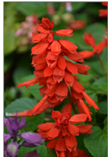
Vista Red Sage flowers