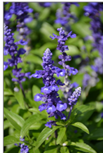
Midnight Candle Salvia flowers

This plant will require occasional maintenance and upkeep, and should be cut back in late fall in preparation for winter. It is a good choice for attracting butterflies and hummingbirds to your yard, but is not particularly attractive to deer who tend to leave it alone in favor of tastier treats. It has no significant negative characteristics.