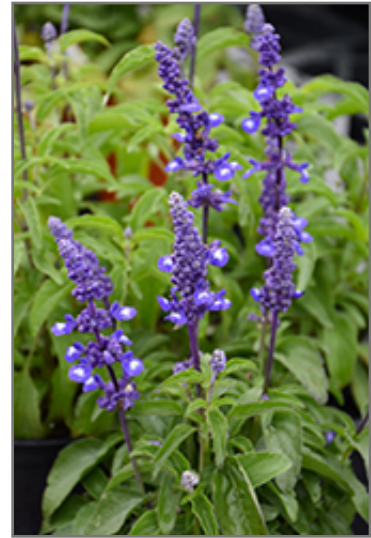
Midnight Candle Salvia flowers

Midnight Candle Salvia will grow to be about 12 inches tall at maturity, with a spread of 15 inches. When grown in masses or used as a bedding plant, individual plants should be spaced approximately 12 inches apart. Although it's not a true annual, this fast-growing plant can be expected to behave as an annual in our climate if left outdoors over the winter, usually needing replacement the following year. As such, gardeners should take into consideration that it will perform differently than it would in its native habitat.