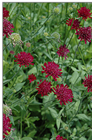
Crimson Scabious flowers

Crimson Scabious will grow to be about 24 inches tall at maturity extending to 3 feet tall with the flowers, with a spread of 24 inches. It tends to be leggy, with a typical clearance of 1 foot from the ground, and should be underplanted with lower-growing perennials. It grows at a fast rate, and under ideal conditions can be expected to live for approximately 3 years. As an herbaceous perennial, this plant will usually die back to the crown each winter, and will regrow from the base each spring. Be careful not to disturb the crown in late winter when it may not be readily seen!