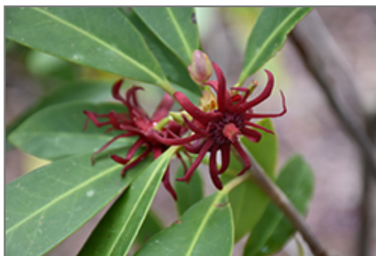
Aztec Fire Mexican Anise Tree flowers