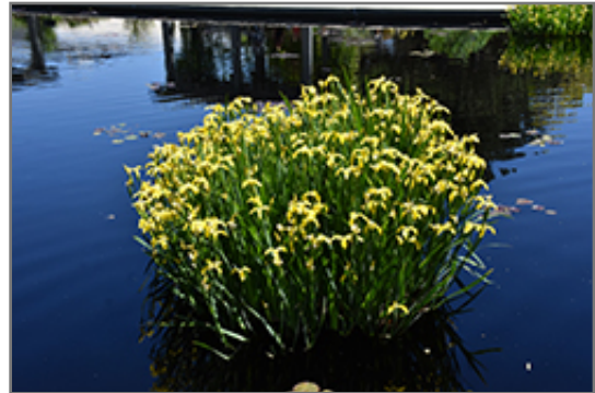
Yellow Flag Iris in bloom