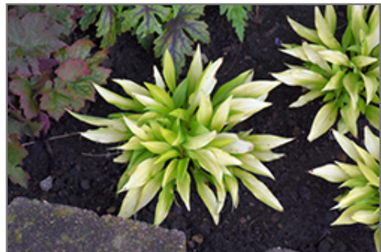
Munchkin Fire Hosta