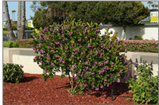
Sweet Pea Shrub in bloom