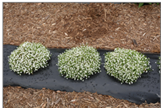
Gypsy White Baby's Breath in bloom