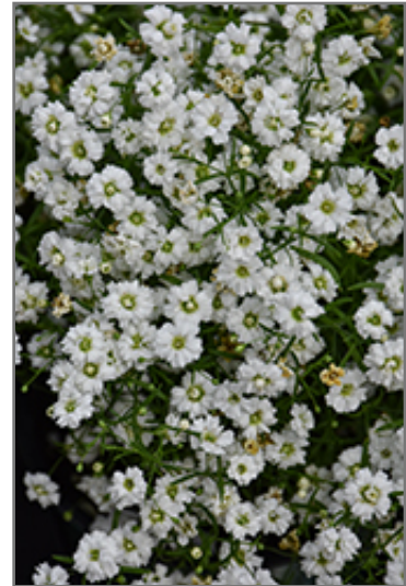
Gypsy White Baby's Breath flowers