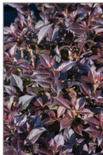
Date Night Stunner Weigela foliage