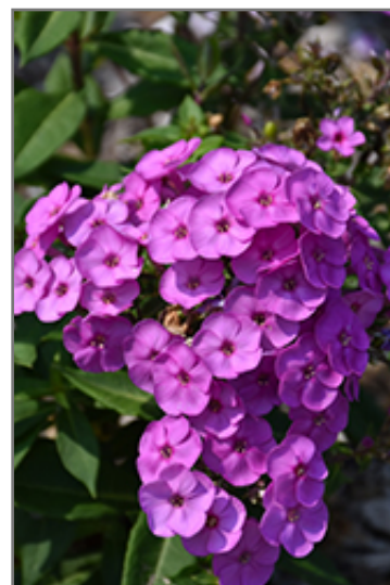
Ka-Pow Lavender Garden Phlox flowers

Ka-Pow Lavender Garden Phlox is recommended for the following landscape applications;