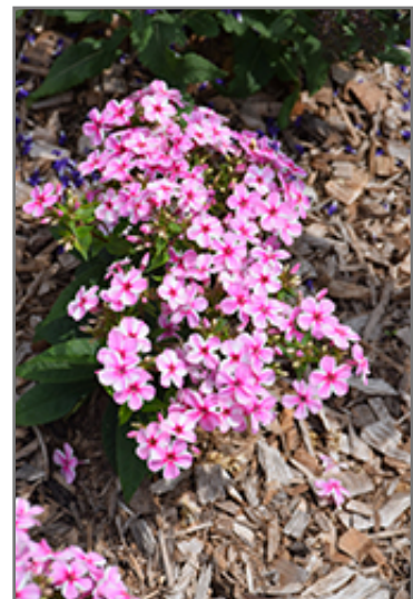
Early Pink Candy Garden Phlox flowers