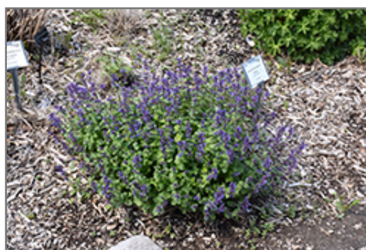
Aroma Violet Catmint in bloom