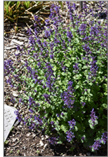
Aroma Violet Catmint flowers

Aroma Violet Catmint is a fine choice for the garden, but it is also a good selection for planting in outdoor pots and containers. It is often used as a 'filler' in the 'spiller-thriller-filler' container combination, providing a mass of flowers against which the thriller plants stand out. Note that when growing plants in outdoor containers and baskets, they may require more frequent waterings than they would in the yard or garden. Be aware that in our climate, most plants cannot be expected to survive the winter if left in containers outdoors, and this plant is no exception. Contact our experts for more information on how to protect it over the winter months.