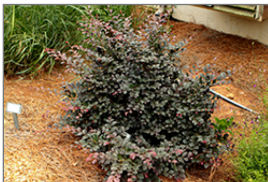
Plum Gorgeous Fringeflower

This plant does best in full sun to partial shade. It does best in average to evenly moist conditions, but will not tolerate standing water. It is particular about its soil conditions, with a strong preference for rich, acidic soils. It is somewhat tolerant of urban pollution. Consider applying a thick mulch around the root zone in winter to protect it in exposed locations or colder microclimates. This is a selected variety of a species not originally from North America.