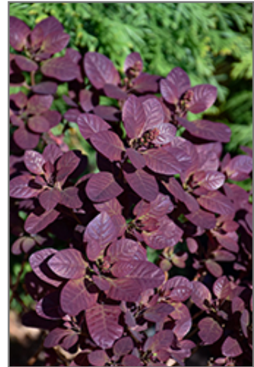
Velveteeny Purple Smokebush foliage

This plant is not reliably hardy in our region, and certain restrictions may apply; contact the store for more information.