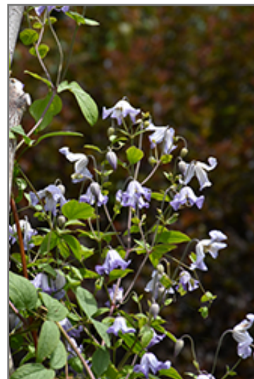
Hanna Clematis flowers