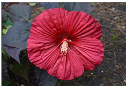
Summerific Holy Grail Hibiscus flowers

This plant will require occasional maintenance and upkeep, and should be cut back in late fall in preparation for winter. It is a good choice for attracting butterflies and hummingbirds to your yard. Gardeners should be aware of the following characteristic(s) that may warrant special consideration;