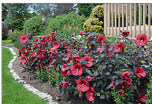
Summerific Holy Grail Hibiscus in bloom