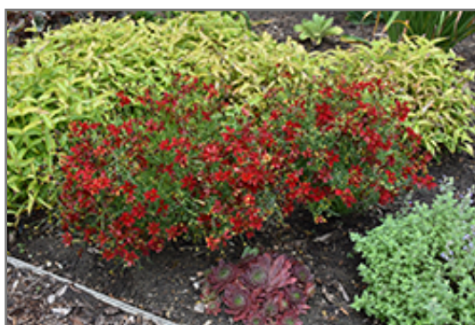
Sizzle And Spice Hot Paprika Tickseed in bloom