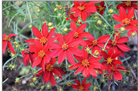
Sizzle And Spice Hot Paprika Tickseed flowers

Sizzle And Spice Hot Paprika Tickseed will grow to be about 15 inches tall at maturity, with a spread of 24 inches. Its foliage tends to remain dense right to the ground, not requiring facer plants in front. It grows at a medium rate, and under ideal conditions can be expected to live for approximately 8 years. As an herbaceous perennial, this plant will usually die back to the crown each winter, and will regrow from the base each spring. Be careful not to disturb the crown in late winter when it may not be readily seen!