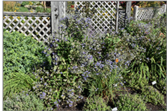
Stand By Me Bush Clematis in bloom

This plant is not reliably hardy in our region, and certain restrictions may apply; contact the store for more information.