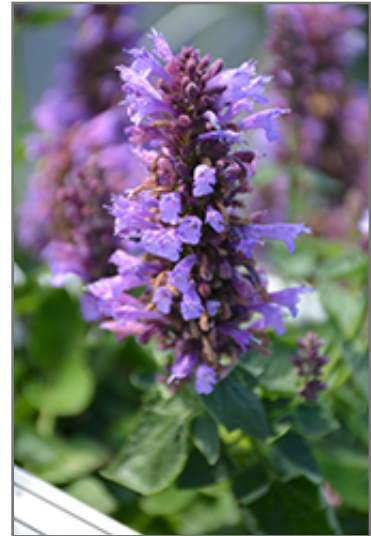
Poquito Dark Blue Hyssop flowers

Poquito Dark Blue Hyssop is a fine choice for the garden, but it is also a good selection for planting in outdoor pots and containers. It is often used as a 'filler' in the 'spiller-thriller-filler' container combination, providing a mass of flowers against which the larger thriller plants stand out. Note that when growing plants in outdoor containers and baskets, they may require more frequent waterings than they would in the yard or garden.