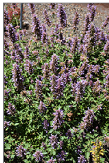
Poquito Dark Blue Hyssop flowers