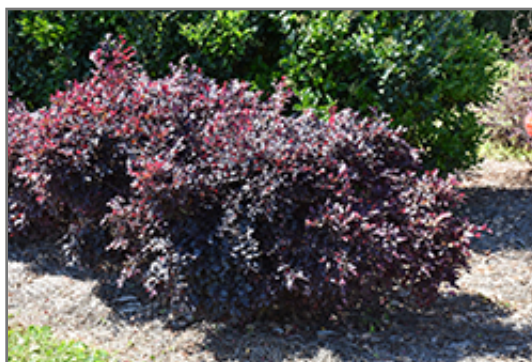
Purple Daydream Fringeflower