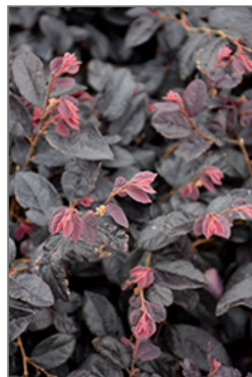
Cherry Blast Fringeflower foliage