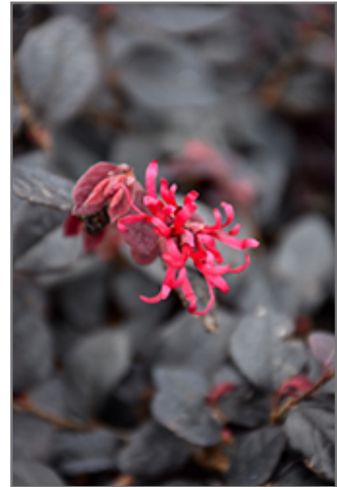
Cherry Blast Fringeflower flowers

This plant is not reliably hardy in our region, and certain restrictions may apply; contact the store for more information.