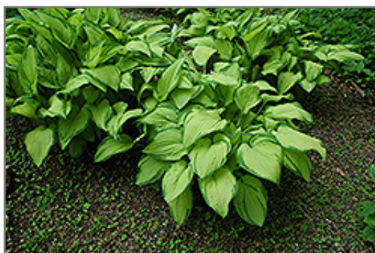
Gold Standard Hosta