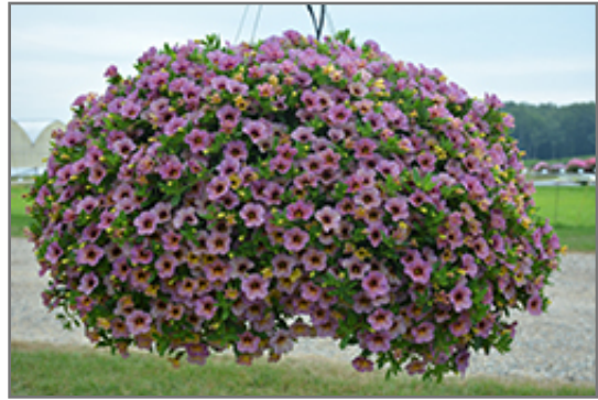
Chameleon Blueberry Scone Calibrachoa in bloom