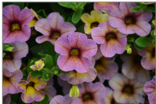
Chameleon Blueberry Scone Calibrachoa flowers