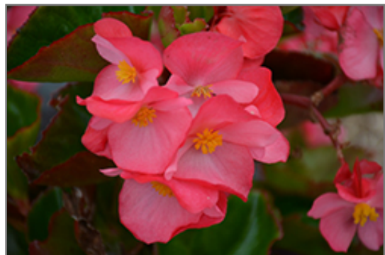
Megawatt Rose Green Leaf Begonia flowers