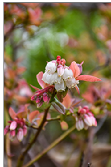
Blueberry Glaze Blueberry flowers

This plant is not reliably hardy in our region, and certain restrictions may apply; contact the store for more information.