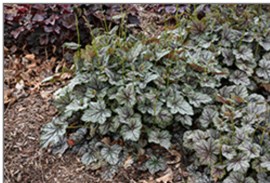
Green Spice Coral Bells

Green Spice Coral Bells will grow to be about 10 inches tall at maturity extending to 24 inches tall with the flowers, with a spread of 12 inches. When grown in masses or used as a bedding plant, individual plants should be spaced approximately 10 inches apart. Its foliage tends to remain low and dense right to the ground. It grows at a medium rate, and under ideal conditions can be expected to live for approximately 10 years. As an evergreen perennial, this plant will typically keep its form and foliage year-round.