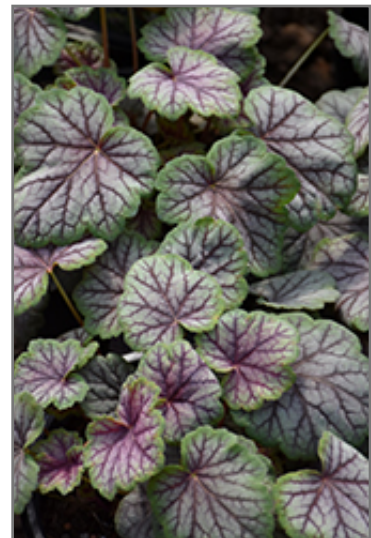
Green Spice Coral Bells foliage