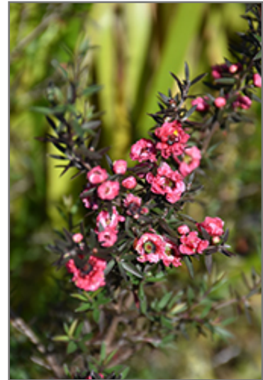
Red Damask Tea-Tree flowers

This plant is not reliably hardy in our region, and certain restrictions may apply; contact the store for more information.