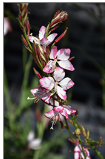
Rosy Jane Gaura flowers

Rosy Jane Gaura is recommended for the following landscape applications;