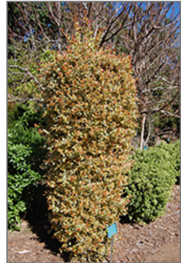
Lemon Swirl Variegated Brush Cherry

This plant is not reliably hardy in our region, and certain restrictions may apply; contact the store for more information.