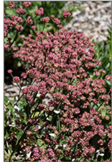
Red Buckwheat flowers

Red Buckwheat is recommended for the following landscape applications;