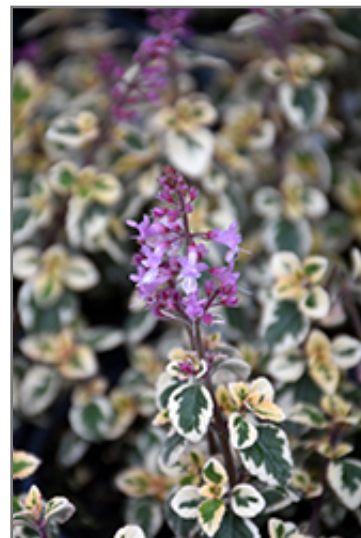
Candy Kisses Wild Sage flowers

Candy Kisses Wild Sage is recommended for the following landscape applications;