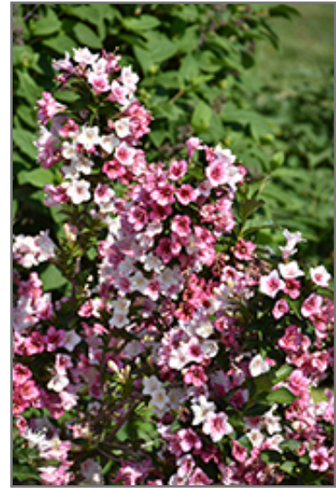
Czechmark Trilogy Weigela flowers

This plant is not reliably hardy in our region, and certain restrictions may apply; contact the store for more information.