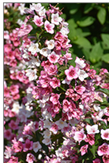
Czechmark Trilogy Weigela flowers