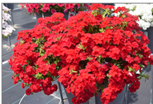
Intensia Red Hot Annual Phlox in bloom