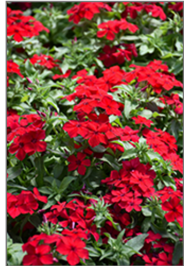
Intensia Red Hot Annual Phlox flowers

Intensia Red Hot Annual Phlox is a fine choice for the garden, but it is also a good selection for planting in outdoor containers and hanging baskets. It is often used as a 'filler' in the 'spiller-thriller-filler' container combination, providing a mass of flowers against which the thriller plants stand out. Note that when growing plants in outdoor containers and baskets, they may require more frequent waterings than they would in the yard or garden.